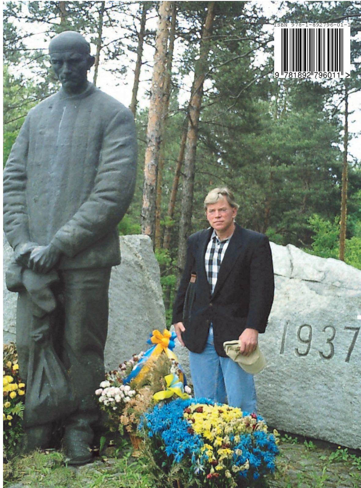
Dr. David Duke - Shown at a memorial to the Ukrainian Holodomor. He spent five years in Russia, Ukraine and Eastern Europe where he researched the origins of the Communist Revolution and the genocide of the Red Terror.

He has appeared on over a thousand television and radio programs world wide, including three appearances on America's most popular political TV program, Meet the Press , as well as on CNN, BBC and many others. His videos have had hundreds of millions of views, and an average over a 90 percent approval rating from viewers.